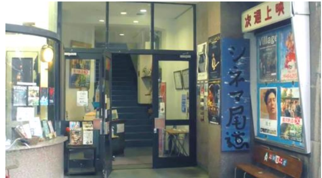
Cinema Onomichi (Onomichi, Hiroshima)