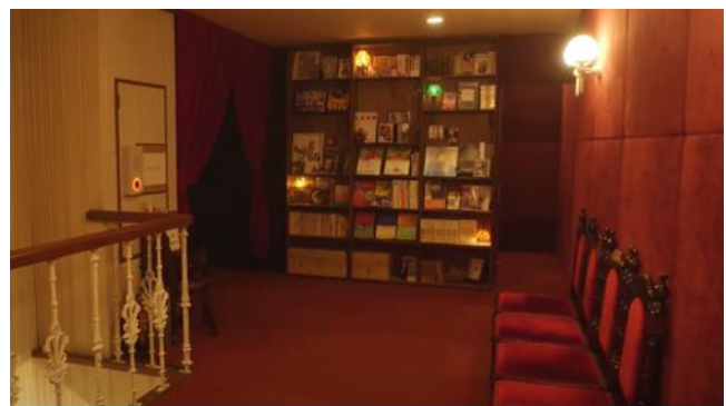
Cinekoya (Fujisawa, Kanagawa)