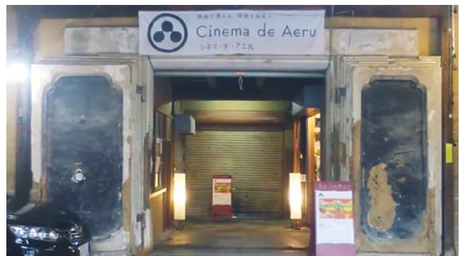
Cinema de Aeru (Miyako, Iwate)