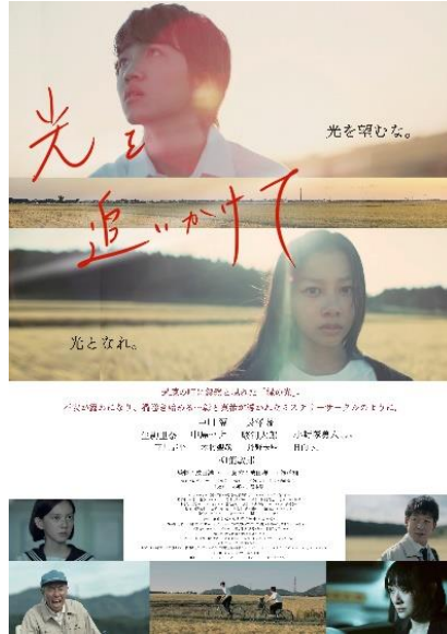
©2021 Follow the Light Film Partners [Selected by Cinema de Aeru] Follow the Light (2021) Directed by NARITA Yoichi