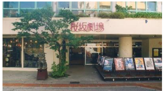
Sakurazaka Theater (Naha, Okinawa)