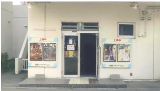
CINEMA IRIS (Hakodate, Hokkaido)