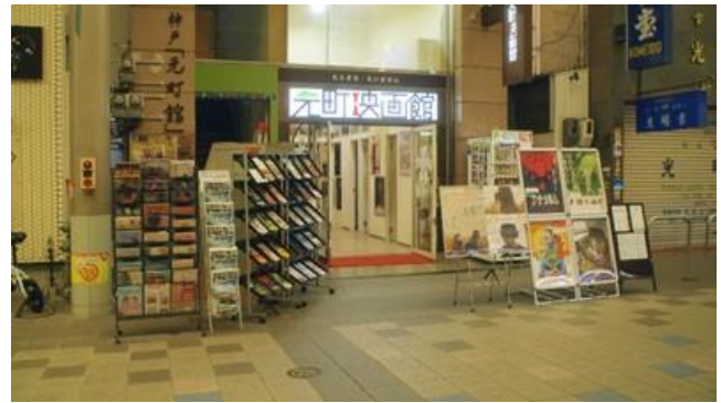
Motomachi Movie Theater (Kobe, Hyogo)