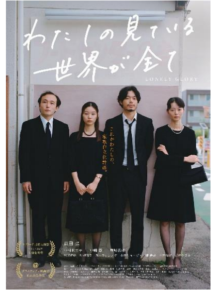
©2022 Tokyo New Cinema [Selected by Cinekoya] LONELY GLORY (2022) Directed by SAKON Keitaro