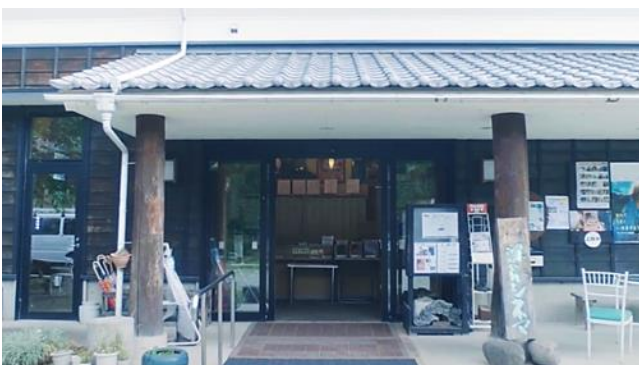
fukaya cinema (Fukaya, Saitama)