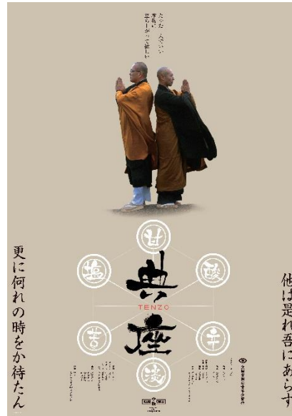
©Kuzoku Inc. [Selected by jig theater] TENZO (2019) Directed by TOMITA Katsuya